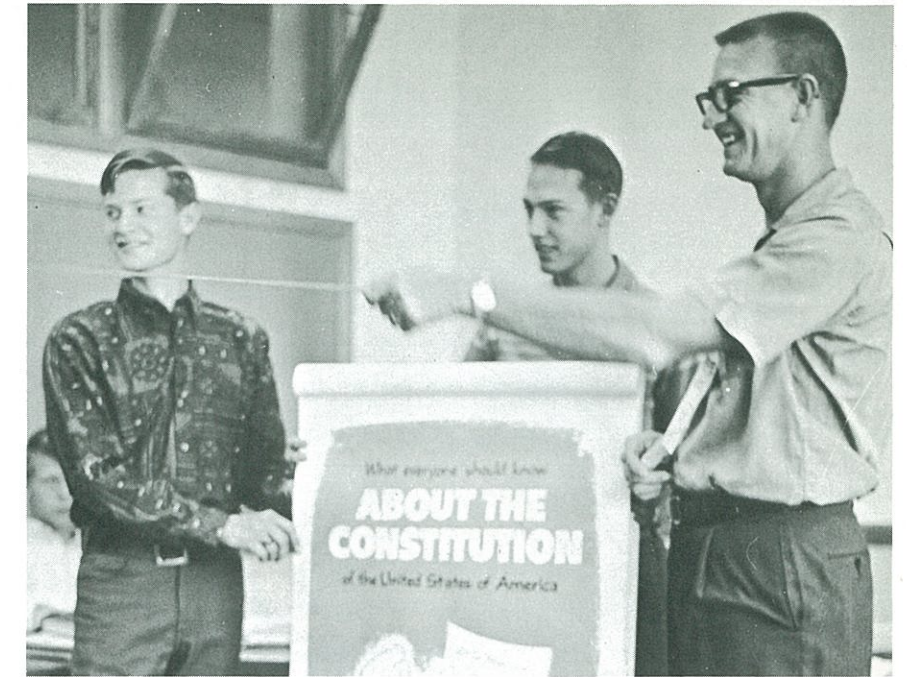
"Hey, lookee there!"